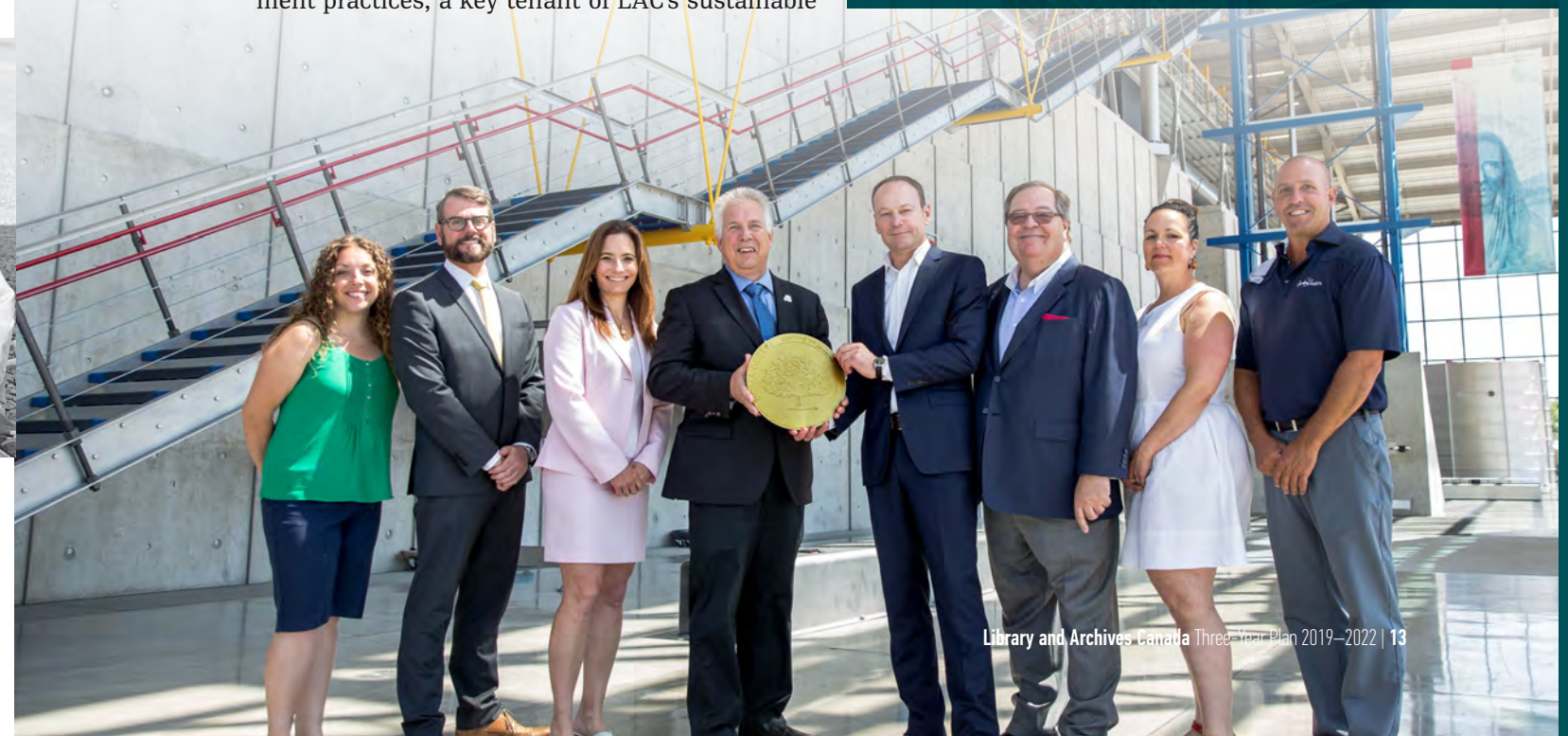
Library and Archives Canada Three-Year Plan 2019–2022 | 13