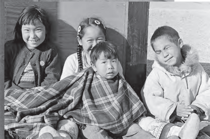
Library and Archives Canada/National Film Board of Canada fonds/a178998 ↑