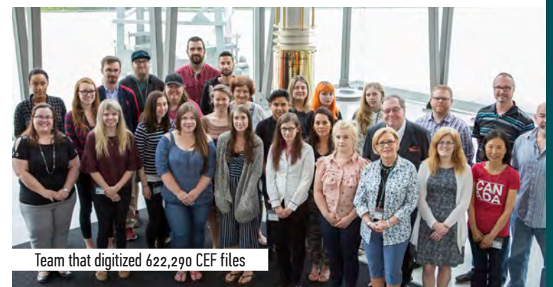
Team that digitized 622,290 CEF files

expertise to maximize the organization's impact. We will continue to collaborate and cooperate with the documentary heritage community in Canada and abroad to find cooperative solutions to enhance the world's documentary heritage—a critical building block of our collective future.