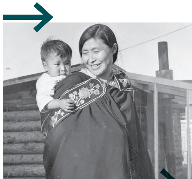
Library and Archives Canada/Department of Indian Affairs and Northern Development fonds/a185627 ↑

We Are Here: Sharing Stories is a program that digitizes LAC records containing First Nations, Inuit, and Métis Nation related content such as treaties, photographs, and Indigenous-language dictionaries and lexicons.